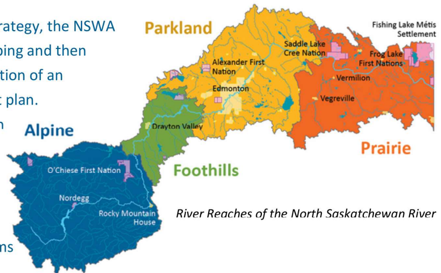
River Reaches of the North Saskatchewan River

Under the Alberta Water for Life strategy, the NSWA carries the responsibility of developing and then encouraging voluntary implementation of an integrated watershed management plan. Implemented through collaboration and community engagement, the plan sets out the actions needed to protect and enhance the quantity and quality of water and the health of aquatic ecosystems within the watershed and support the social and economic well-being of the region.